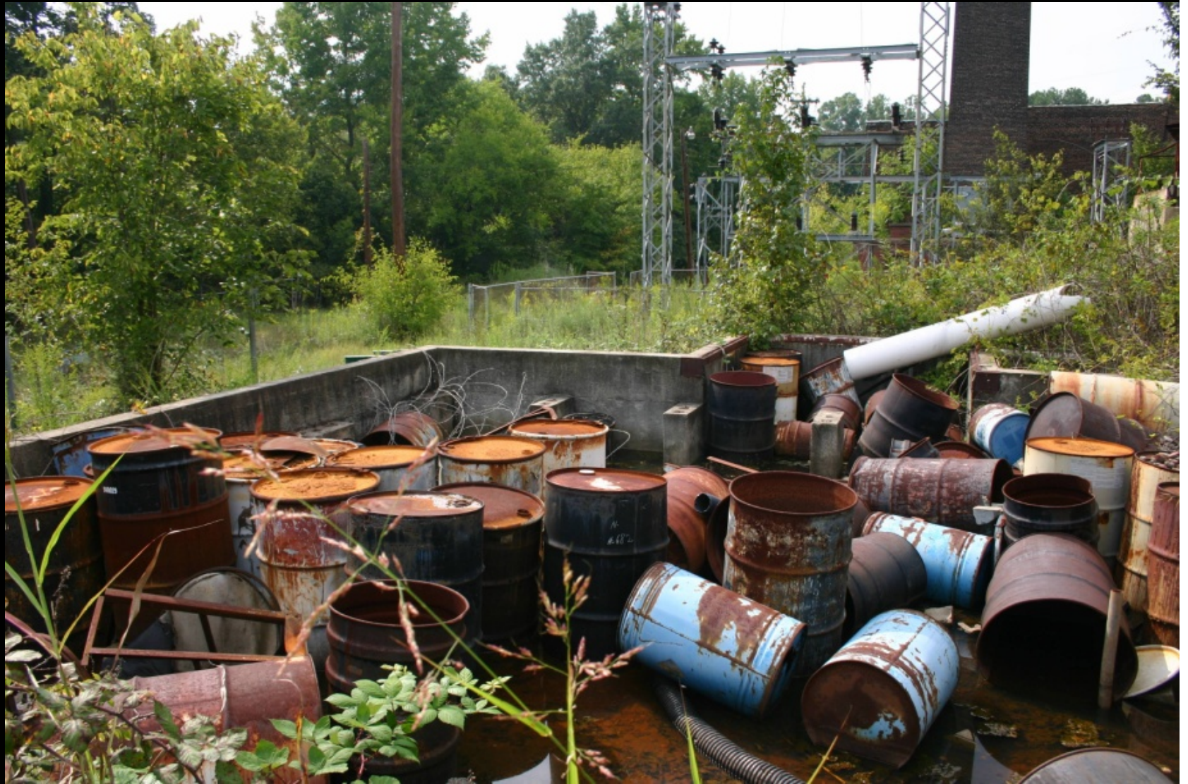
Drums and tanks were scattered throughout the property.